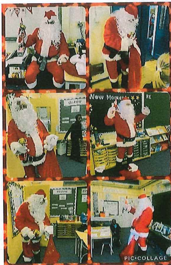
A special visitor from the North Pole!