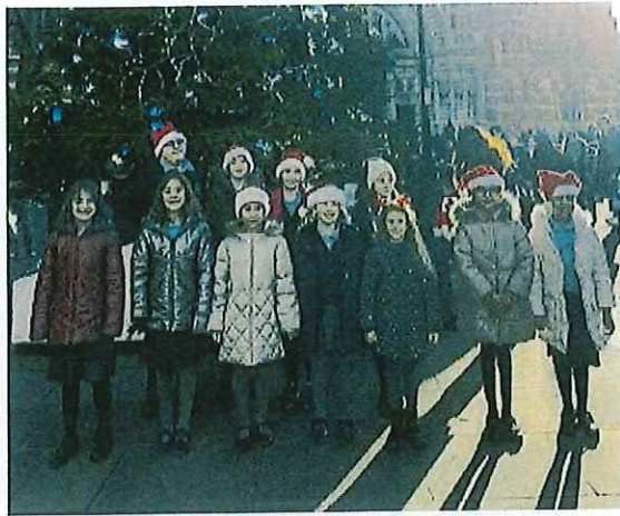
Our Choir at Westminster Cathedral

On Wednesday 18 th December, children also enjoyed their special Christmas lunch – roast turkey with all of the festive trimmings. Children loved coming together to share their Christmas meals (or packed lunches) and they had a very merry time together. It really was the most joyful lunch of the year and the smiles were there for all to see!