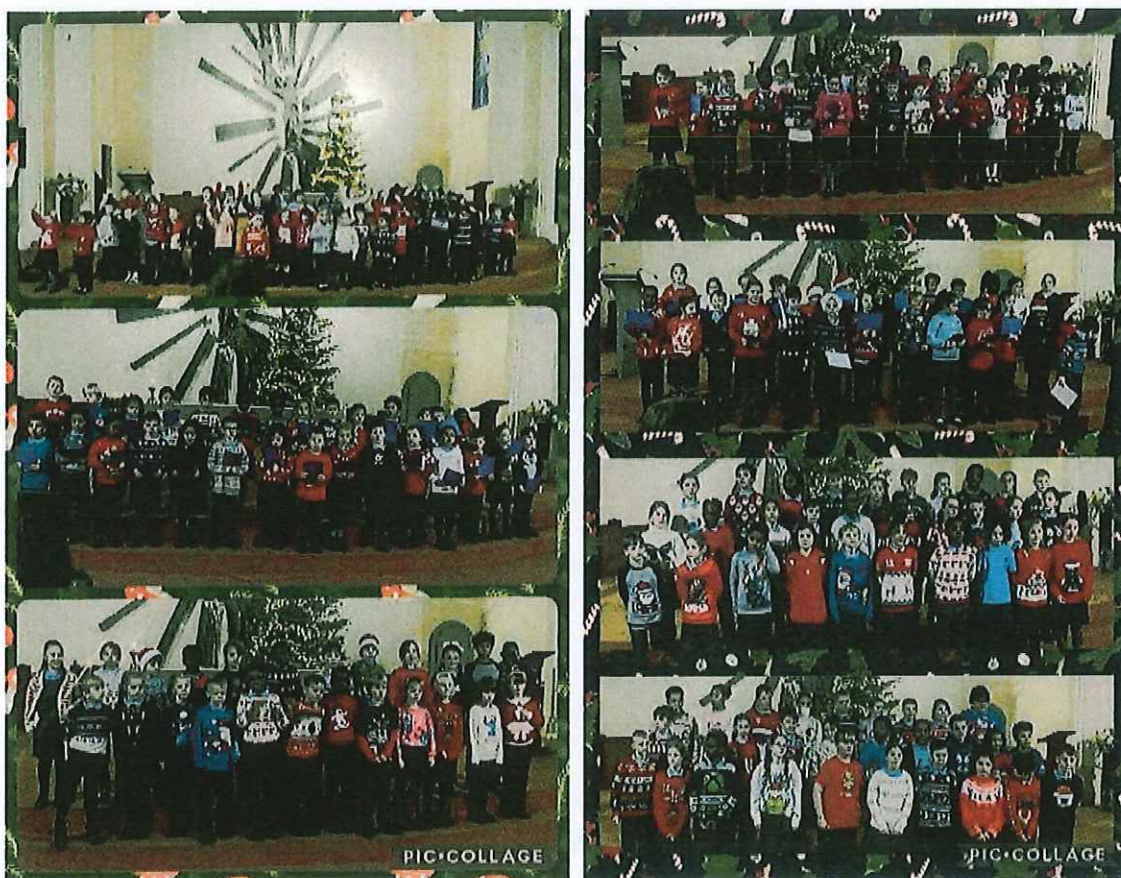
All classes performed so beautifully at the church for our annual Christmas Carol Concert

On Wednesday 11 th December, the whole school, performed our annual Christmas Carol Concert to the school community. The story of Jesus's birth was told through a mixture of traditional Christmas Carols, some more modern festive classics and some beautiful reflective readings and prayers. It gave both our school and Parish community the chance to come together during Advent to prepare ourselves for Christmas and share in the joys and happiness that this time of year brings. Well done, children!