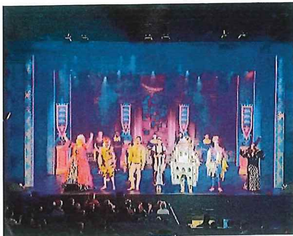
The Festive Pantomime at Campus West