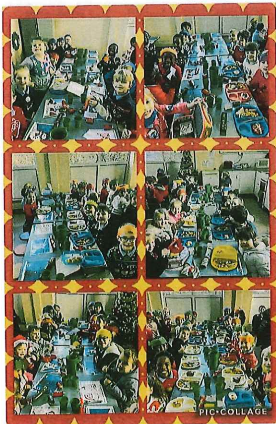
Children enjoying their Christmas lunch

It was such a surprise for the children to see Father Christmas himself coming into their classrooms. We hope this helped to spread a little Christmas cheer to one and all!